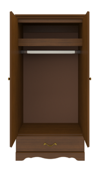
Model: CHWR12 34.5W 23.75D 71H

The Charlotte Collection is the perfect fit for any traditional senior living environment. Gently radiused corners and OG edging protects fragile skin, while the styling uplifts and restores the spirit. Raised cabinetry promises ease of cleaning below case goods.